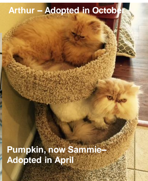
Arthur – Adopted in October