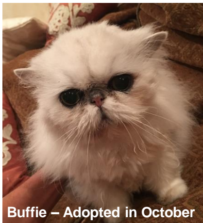
Buffie – Adopted in October