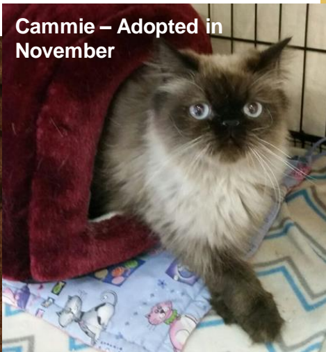
Cammie – Adopted in November